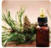
Manufactured products and material