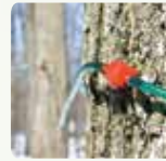
Sugarbush development management plans