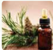
Manufactured products and material